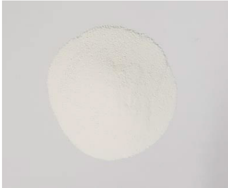
Agglomerated Hard Burned Magnesia